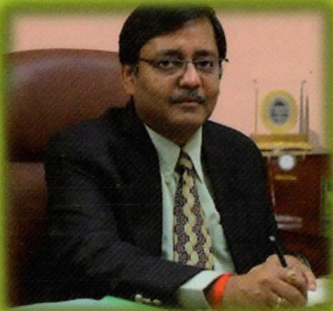
Honorable Vice -Chairman

July 2015 –December 2015, Vol. 1 Issue. 2